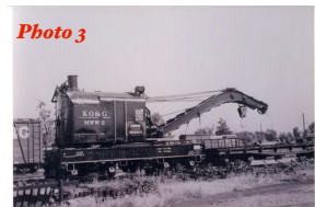
Photo 1 - Fort Smith & Western 4-4-0 American, Fort Smith, AR circa 1935. Photo 2 - Midland Valley new engine terminal at Tupelo, OK circa 1920 Photo 3 - Kansas, Oklahoma & Gulf steam wrecker at Muskogee, OK circa 1950