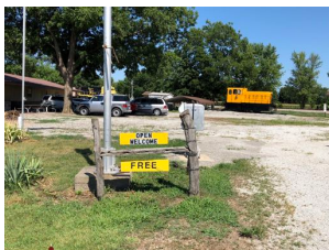
Museum open for visitors July 2018