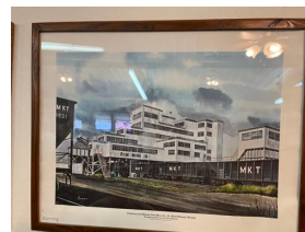
P&M Mine #19 - Fogg print