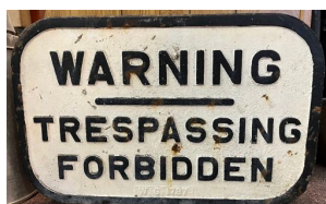
MKT cast iron No Trespassing sign