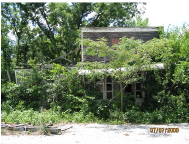
Photo taken July 2009