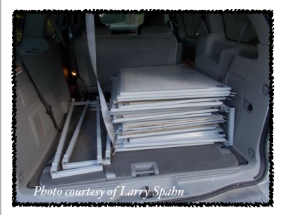
Jane Ballard Display Donation