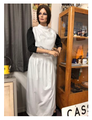
Answer next month

This is an item that is currently located in the Carona museum. What is it?