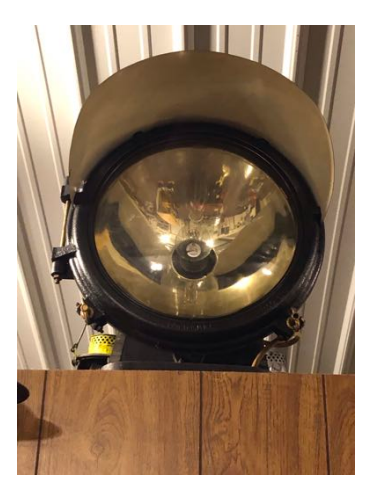
Answer next month

This is an item that is currently located in the Carona museum. What is it?