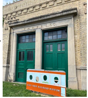
The Museum is housed in the former TMER&L substation in East Troy.

Day, Chicago Day, Beer Tasting Train, Halloween Trains and Christmas Trains fill out the year. Also, they offer dinner rides, 17 of them this year, on their