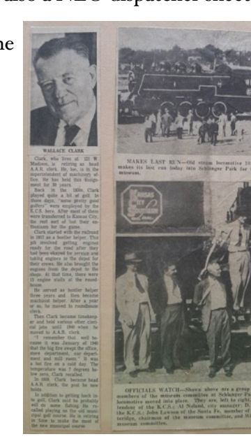
Moving the 1023 to Schlanger Park

Dec 27-28, 1960. This sheet is filled out by the dispatcher and shows what trains operated that day and includes other information.